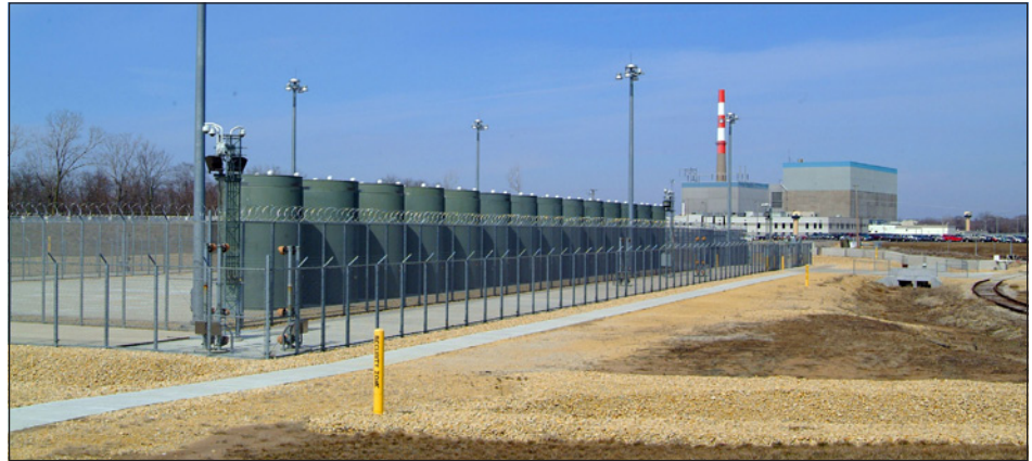
Similar Independent Spent Fuel Storage Installation at Quad Cities in Illinois At Zion Station, the dry fuel storage facility will be farther from the lakefront than its current location.

Dry storage concepts that do not adhere to current standards and regulations are not licensed by the NRC and offer no discernible benefit beyond current technology with respect to public health and safety risk, while displaying numerous features that would potentially diminish efficient and safe storage of spent fuel.